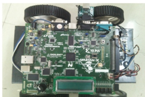
Figure2: Interfacing of FPGA to robot.

operates with a voltage of 12v and a current of 1amp, these motors helps in traversing in four different conditions like front,back,right,left and the default condition is stop where all the motors are in halt mode. The below figure shows us the interfacing of FPGA to therobotic model.The FPGA kit acts as the control unit which takes the commands through the serial port of it interfaced to the Bluetooth module which is placed at the right side of the FPGA board .the blue tooth module here is a serial module which