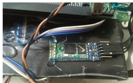
Figure3: interfacing of Bluetooth module HC05.

The power source to the system is a 12v 1.3 amp rechargeable battery is given to a voltage regulator and is dropped to 5v and this 5v is given as input to the FPGA board and to the Bluetooth module.