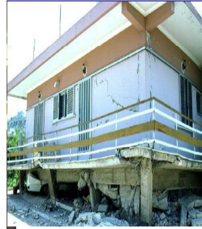
Fig 1.3 Building damage due to effect of soft storey