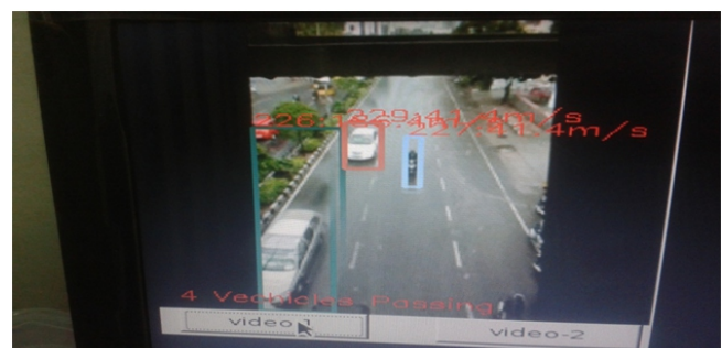
Figure-4: Vehicles speed measurement