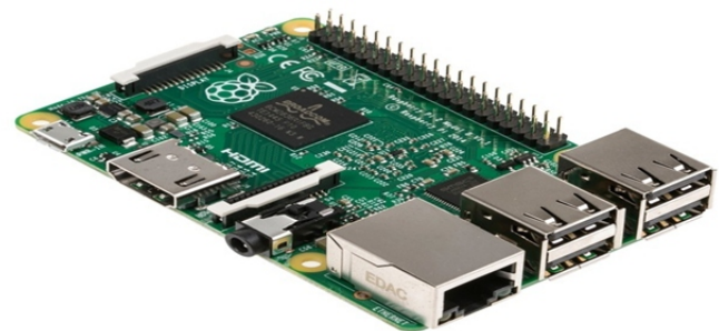
Figure-2: Raspberry Pi processor

Your Raspberry Pi board is a miniature marvel, packing considerable computing power into a footprint no larger than a credit card. It's capable of some amazing things, but there are a few things you're going to need to know before you plunge head-first into the bramble patch. The processor at the heart of the Raspberry Pi system is a Broadcom BCM2836 system-on-chip (SoC) multimedia processor. This means that the vast majority of the system's components, including its central and graphics processing units along with the audio and communications hardware, are built onto that single component hidden beneath the 256 MB memory chip at the centre of the board. It's not just this SoC design that makes the BCM2836 different to the processor found in your desktop or laptop, however. It also uses a different instruction set architecture (ISA), known as ARM. A better-quality picture can be obtained using the HDMI (High Definition Multimedia Interface) connector, the only port found on the bottom of the Pi.