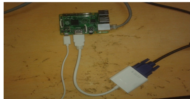
Figure-3: Hardware Implementation