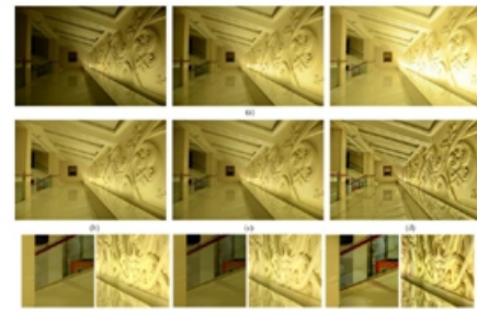
Fig. 4. Performance comparisons on the upper sequence with the proposed fusion approach [21] and the global method fusion approach [21] (a) Input image. (b) Result by [21]. (c) Result by [21]. (d) Our result. (e) Clear-up of (b). (f) Clear-up of (c). (g) Clear-up of (d).

Our boosting process is guided by the aforementioned local exposure weight and JND-based saliency weight with different exposure images. It is very useful to correctly select the salient regions to boost, and the boosting level is controlled by the exposure quality measurement. In order to avoid the color casting artifacts, we multiply the RGB triplet by a scalar, which keeps the chromaticity unchanged before and after signal boosting and reduces the color distortion. Fig. 3 gives an illustration of our boosting on the magnitude of the RGB color vector along the direction of this color vector. The direction of the RGB color vector lies in the line of 45 degrees diagonal, which means that the direction of this color vector does not change before and after using our boosting Laplacian pyramid (Fig. 3, third row). At the same time, the magnitude of the RGB color vector increases nonlinearly before and after the boosting process (Fig. 3, bottom row). Our boosting method preserves the structure and texture details so as to get a natural and visually pleasing fusion result.