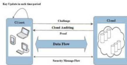
Fig. 1.1. System model of current cloud storage auditing