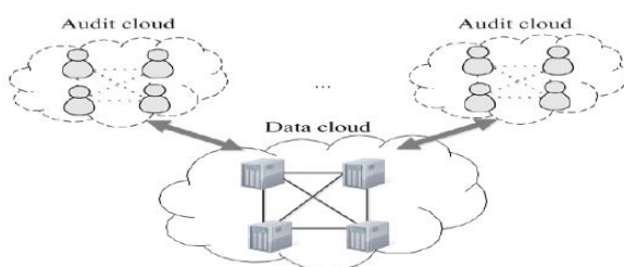
Fig. 2. Consistency as a service model.