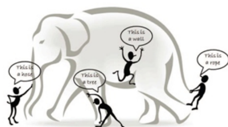
Fig. 1. The blind men and the giant elephant: the localized (limited) view of each blind man leads to a biased conclusion.

As a result, the unprecedented data volumes require an effective data analysis and prediction platform to achieve fast response and real-time classification for such Big Data. The remainder of the paper is structured as follows: In Section 2, we propose a HACE theorem to model Big Data characteristics.