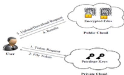
fig: Architecture of Authorized de-duplication

Our implementation of the Client provides the following function calls to support token generation and de-duplication along the file upload process.