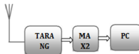
Fig 1.2 Receiver Side

The project is designed with PIC microcontroller, resistive touch panel, RFID module and wireless system. Here RFID, touch panel is interfaced with microcontroller through a relay and makes a serial communication. Wireless system such as tarang module is interfaced with serial port of microcontroller. The RFID and Touch panel is interfaced with RDO through relay. Hence when relay is OFF (NC+COM), RFID mode is enabled and when relay is ON (NO+COM), Touch mode is enabled. Here mode selection is done through two switches.