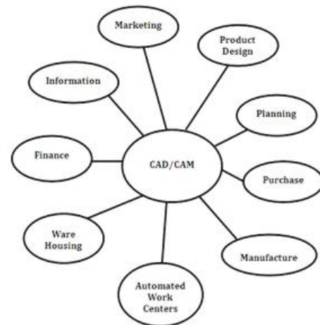
Fig. 3: CAD/CAM Database

Rapid Prototyping technology is being more widely employed to verify and improve designs, rapid tooling as well as initial prototypes.