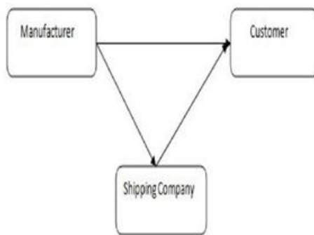
Figure 1. Access Control and Event Dependency

Our contribution is the mapping of concepts from EPNs to colored Petri nets with a discussion of design choices. Further, we report on the validation of the colored Petri net obtained for the FFDA with its implementation in ETALIS, an