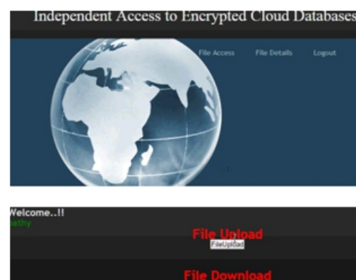
Fig 2: File Upload and Download Module.