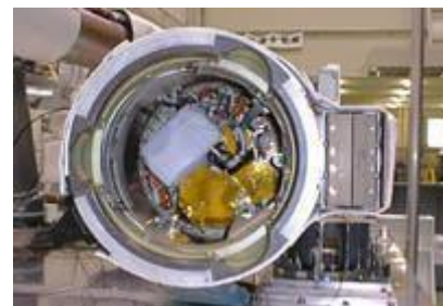
Figure 3: shuttle robot arm observed from the deck