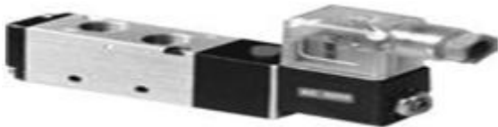
Fig 6. Solenoid operated spring return 5/2 DCV

The DCV shown in figure 6 serves the purpose of controlling the two pneumatic cylinders according to the signal received from the microcontroller. The DCV has a solenoid operating at 12 Volt. The normally open port of the DCV is connected to the extension port weight-lifting cylinder so as to keep the self-weight in a lifted condition. The normally closed port of the DCV is connected to the extension port of chuck cylinder so that when the solenoid is actuated by the signal from the controller, it extends and holds the work-piece tightly.