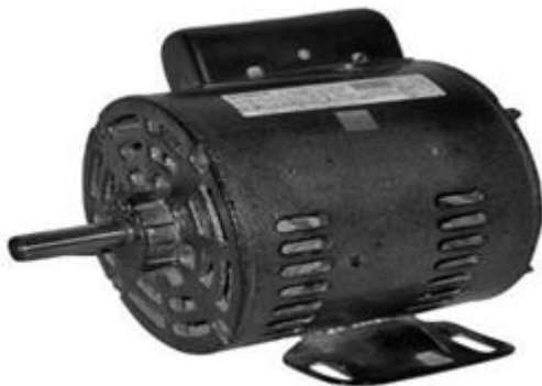
Fig. 3 AC motor used for cutting process

The reciprocating motion of the Hacksaw blade, which is where the cutting process takes place, is produced with the help of an AC motor shown in figure 3, which operates by a simple crank mechanism to convert rotary motion in to reciprocating motion.