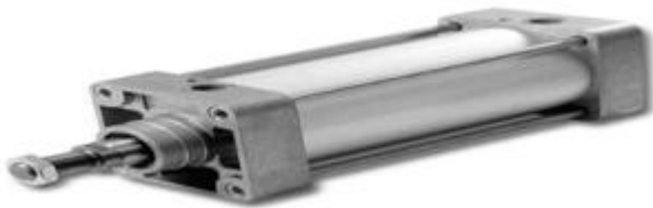
Fig4. Chuck cylinder