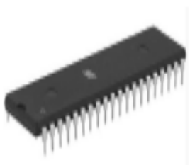
Fig. 7 Microcontroller

The microcontroller AT89C51 shown in figure 7 belongs to the family of 8 bit microcontrollers manufactured by Atmel. It plays the most important part in controlling the electric motors and pneumatic cylinders in the programmed sequence perfectly. AT89C51 has four input and output ports constituting a total of 32 individual inputs and output pins. These controllers are widely used for the purpose of automation because of they are easy to program and sufficient for most of the smaller applications. LCD display shown in figure 8 is used to view the inputs such as number of pieces to be cut, length of each piece to be cut, that the user specifies through keypad. The LCD prompts the user to enter his data.