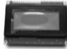
Fig. 8 LCD Display