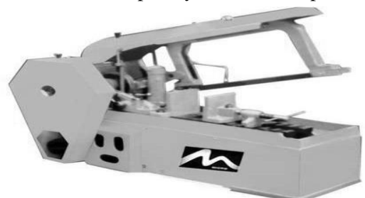
Fig 1.Power Hacksaw Machine

Power hacksaws are used to cut large sections of metal or plastic shafts and rods. Cutting of solid shafts or rods of diameters more than fifteen millimeters is a very hard work with a normal hand held hacksaw. Therefore power hacksaw machine was invented during 1920s in the United States to carry out the difficult and time consuming work. This power hacksaw machine shown in figure 1 is considered as an automatic machine because the operator need not be there to provide the reciprocating motion and downward force on the work-piece in order to cut it. Once the operator has fed the work-piece till the required length in to the machine and starts the machine, then the machine will cut until the work-piece has been completely cut in to two pieces.