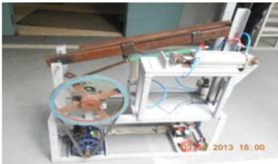
Fig.12 Photographic view of mechanical setup