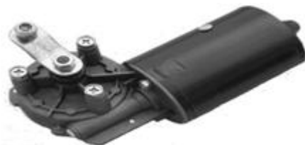
Fig 2 Conveyor motor

The conveyor roller is coupled to the dc motor shown in figure 2 through a chain drive and is driven when the microcontroller sends a signal to it. The conveyor runs till the specified length of work-piece is fed in to the chuck. This is achieved with the help of an IR sensor and a toothed disc attached to the conveyor shaft, which together function as an Encoder.