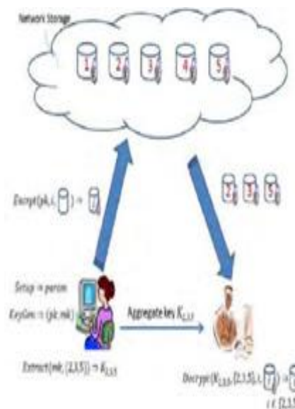
Figure 4: Using KAC for data sharing in cloud storage (Key-Aggregate Cryptosystem for Scalable Data Sharing in Cloud Storage [1])

In modern cryptography, a fundamental problem often studied is that leveraging the secrecy of a small piece of knowledge into the ability to perform the cryptographic functions (e.g., encryption, authentication) multiple times making a decryption key more powerful in the sense that it allows decryption of multiple cipher texts, without increasing its size. This problem is solved by introducing a special type of public-key encryption which is called as key-aggregate cryptosystem (KAC)