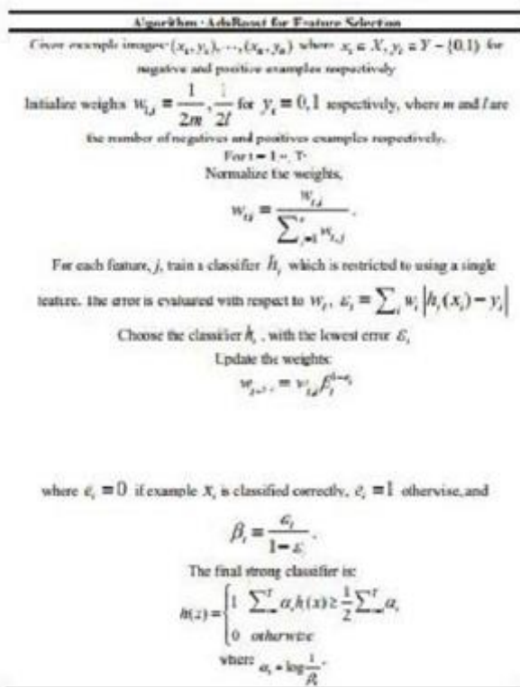
Figure 2: Process of Adaboost algorithm

AdaBoost is one of the most important fast convergences, and easy capturing machine learning algorithm. It requires no prior knowledge about the weak learner and can be easily combined with other method to find weak hypothesis, such as support vector machine. Feature selection is an optimization process to reduce a large set of original rough features to a relatively smaller feature subset which containing only significant to improve the classification accuracy fast and effectively.