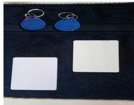
2. RFID tags