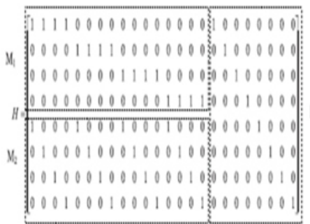
Fig 1 Parity check matrix for OLS code with k = 16 and t = 1 .

OLS codes are based on the concept of Latin squares. A Latin square of size m is an m \times m matrix that has permutations of the digits 0, 1, \dots, m - 1 in both its rows and columns [19]. Two Latin squares are orthogonal if when they are superimposed every ordered pair of elements appears only once. OLS codes are derived from OLS [10]. These codes have k = m^2 data bits and 2tm check bits, where t is the number of errors that the code can correct. For a double error correction code t = 2 , and, therefore, 4m check bits, are used. As mentioned in the introduction, one advantage of OLS codes is that their construction is modular. This means that to obtain a code that can correct t + 1 errors, simply 2m check bits are added to the code that can correct t errors. This can be useful to implement adaptive error correction schemes, as discussed in [11] and [13]. The modular property also enables the selection of the error correction capability for a given word size.