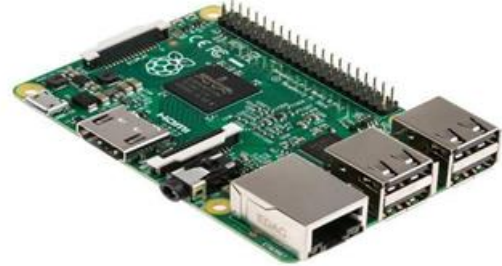
Figure-2: Raspberry Pi processor

perfect pictures on both computer monitors and high-definition TV sets. Using the HDMI port, a Pi can display images at the Full HD 1920x1080 resolution of most modern HDTV sets.