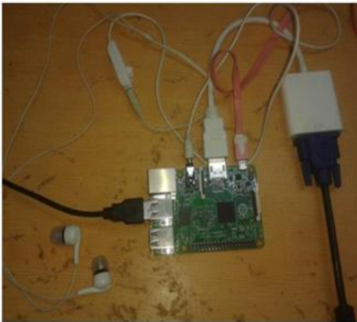
Figure-3: Hardware implementation