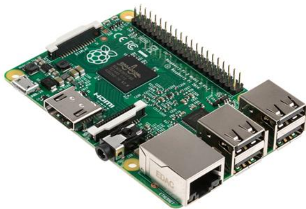
Figure-2: Raspberry Pi diagram

The Raspberry Pi board involves a processor and snap shots chip, Random Access Memory (RAM) and more than a few interfaces and connectors for external devices. Some of these instruments are main others are optional. It operates in the identical method as a ordinary pc, requiring a keyboard for command entry, a show unit and a vigor give.