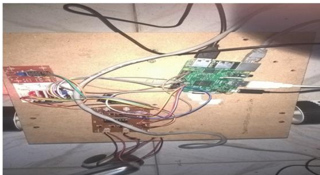
Figure-4: Hardware Implementation