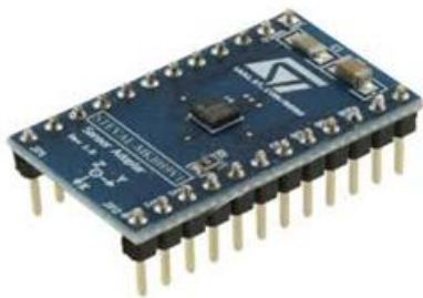
Figure-3: MEMS sensor