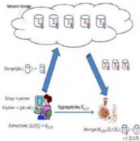
Figure 4: Using KAC for data sharing in cloud storage (Key-Aggregate Cryptosystem for Scalable Data Sharing in Cloud Storage [1])

In modern cryptography, a fundamental problem often studied is that leveraging the secrecy of a small piece of knowledge into the ability to perform the cryptographic functions (e.g., encryption, authentication) multiple times making a decryption key more powerful in the sense that it allows decryption of multiple cipher texts, without increasing its size. This problem is solved by introducing a special type of public-key encryption which is called as key-aggregate cryptosystem (KAC)