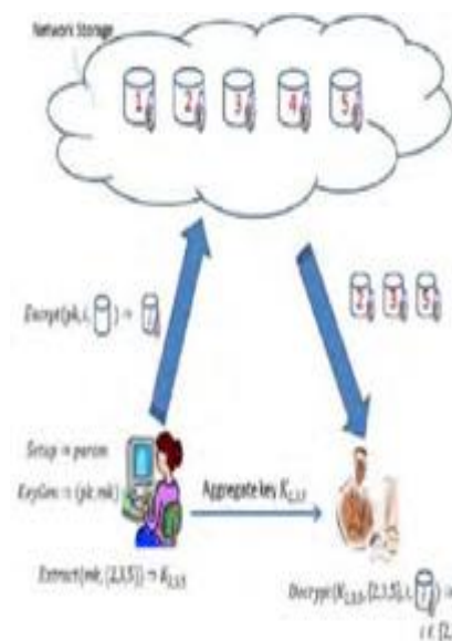
Figure 4: Using KAC for data sharing in cloud storage (Key-Aggregate Cryptosystem for Scalable Data Sharing in Cloud Storage [1])

In modern cryptography, a fundamental problem often studied is that leveraging the secrecy of a small piece of knowledge into the ability to perform the cryptographic functions (e.g., encryption, authentication) multiple times making a decryption key more powerful in the sense that it allows decryption of multiple cipher texts, without increasing its size. This problem is solved by introducing a special type of public-key encryption which is called as key-aggregate cryptosystem (KAC)