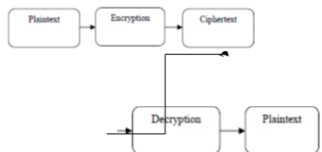
Figure 1: The encryption process converts plaintext into ciphertext and the decryption process converts ciphertexts into plaintext.

can access. It is the knowledge of securing the message by encoding it into an unreadable format. The basic goal of cryptography is the ability to send the information to the receiver in a way that prevents attackers from accessing it. This information is stored on cloud through the internet. The cloud storage is a cloud computing model in which the information is stored and remote servers are accessed from the internet. The cloud storage provider is maintaining, operating and managing the cloud storage on a server. Cryptographic mechanism is used to hide the information from unauthorized users. The most encryption algorithms can be broken and the information is stolen by the attacker. So a more realistic goal of cryptography is to make gaining the information too severe to be value it to the attacker.