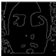
Fig.. Edge Detection and Size Reduction

Image edges are detected and marked in this stage. End points of features, chooses the dimensionality reducing linear projection that maximize the scatter of all projected samples.