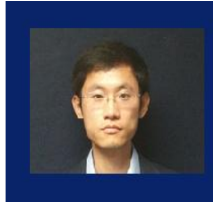
Fig.2. Image to be read

distinguish the face by distance and scale of those organs.