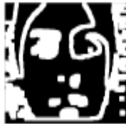
Fig.. Noise Removal from the Image

Noise from the image is removed in this stage using noise removal algorithms